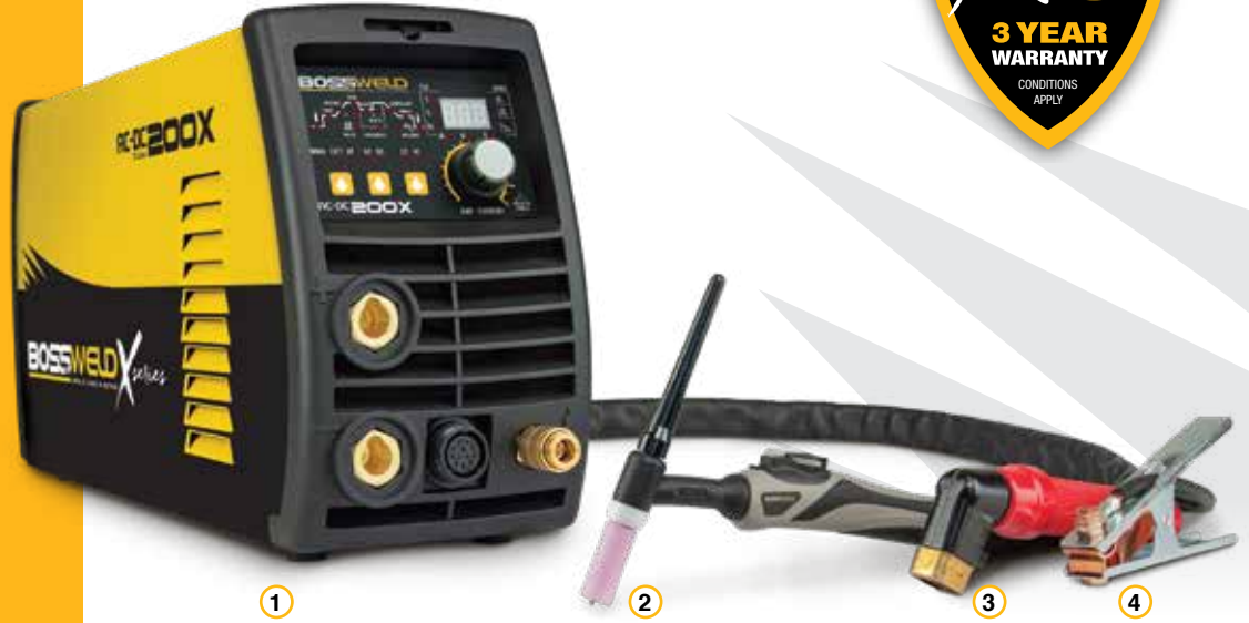
Plate Thickness Maximum 10mm

Material • Mild Steel • Brass • Stainless • Copper • Aluminium